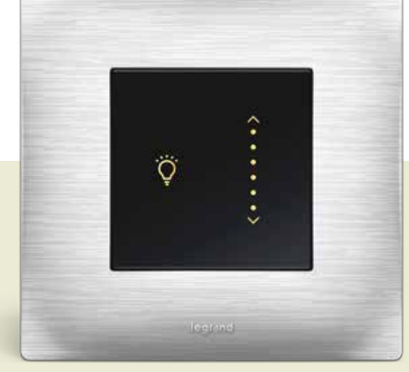
Universal Touch Dimmer