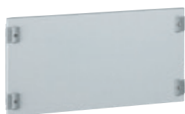
0 208 44