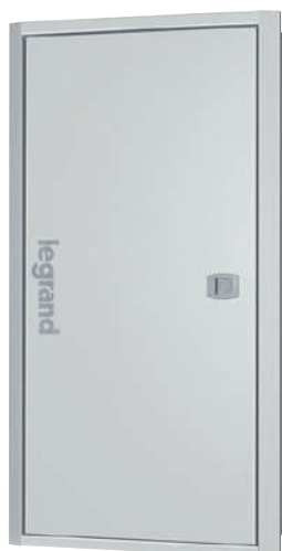
6 054 54

from 12 to 54 poles (outgoing terminals)