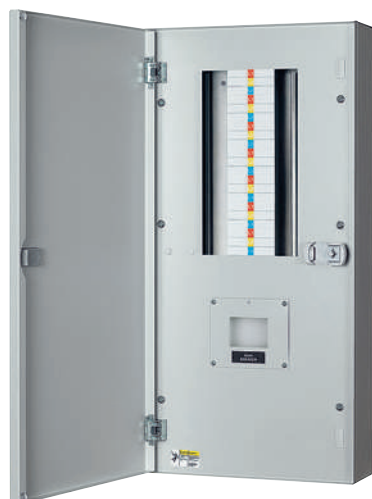
6 054 61