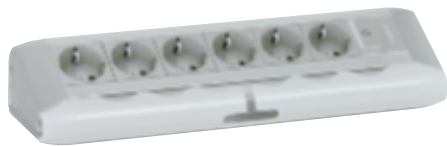
6 535 50