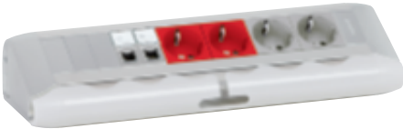
6 535 53