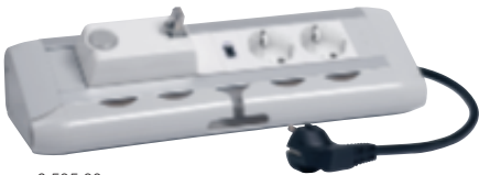
6 535 30

Aluminium extensions with reversible cable guide for grouping cords of connected devices For low current sockets, connection on RJ 45 sockets or area distribution box with specific cord RJ 45/stripped Cat.Nos 0 517 96/97/98 (see p. 676) 2P+E sockets with 45° sloping screw recesses for easy insertion of angled plug 16 A - 250 V - with shutters 3680 W at 230 V per circuit Conform to IEC 60-884-1