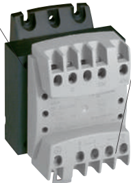
0 428 41 supplied with connection strip