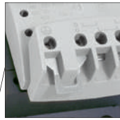
connection strip supplied up to 450 V \sim (except Cat.No 0 428 46)