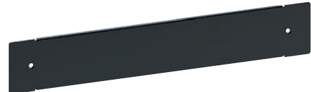
3 382 03