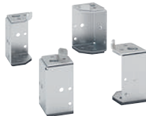
3 382 00