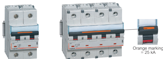
4 097 72

thermal magnetic MCBs from 2 A to 125 A - C and D curves